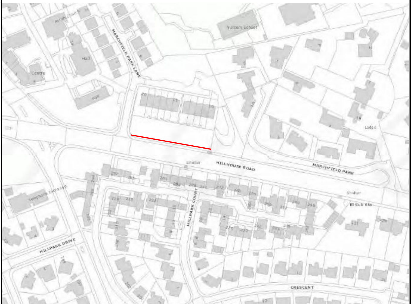
Figure 1: Location plan