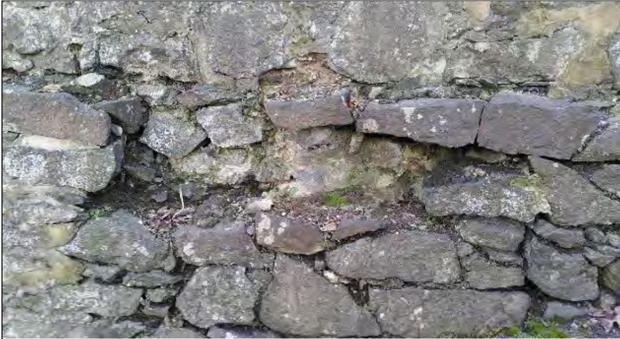
Figure 9: Defect 8