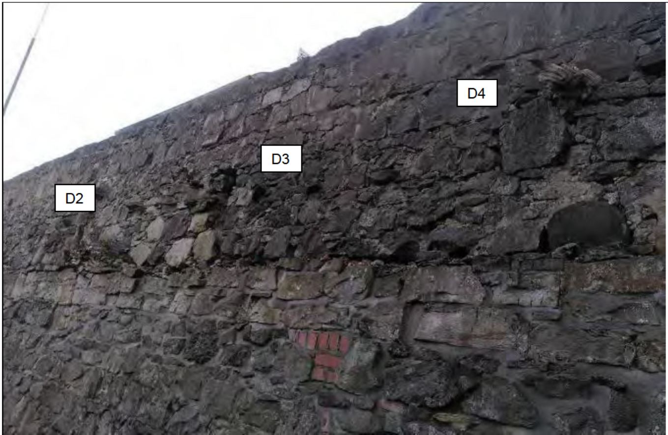
Figure 3: Defects 2, 3 and 4