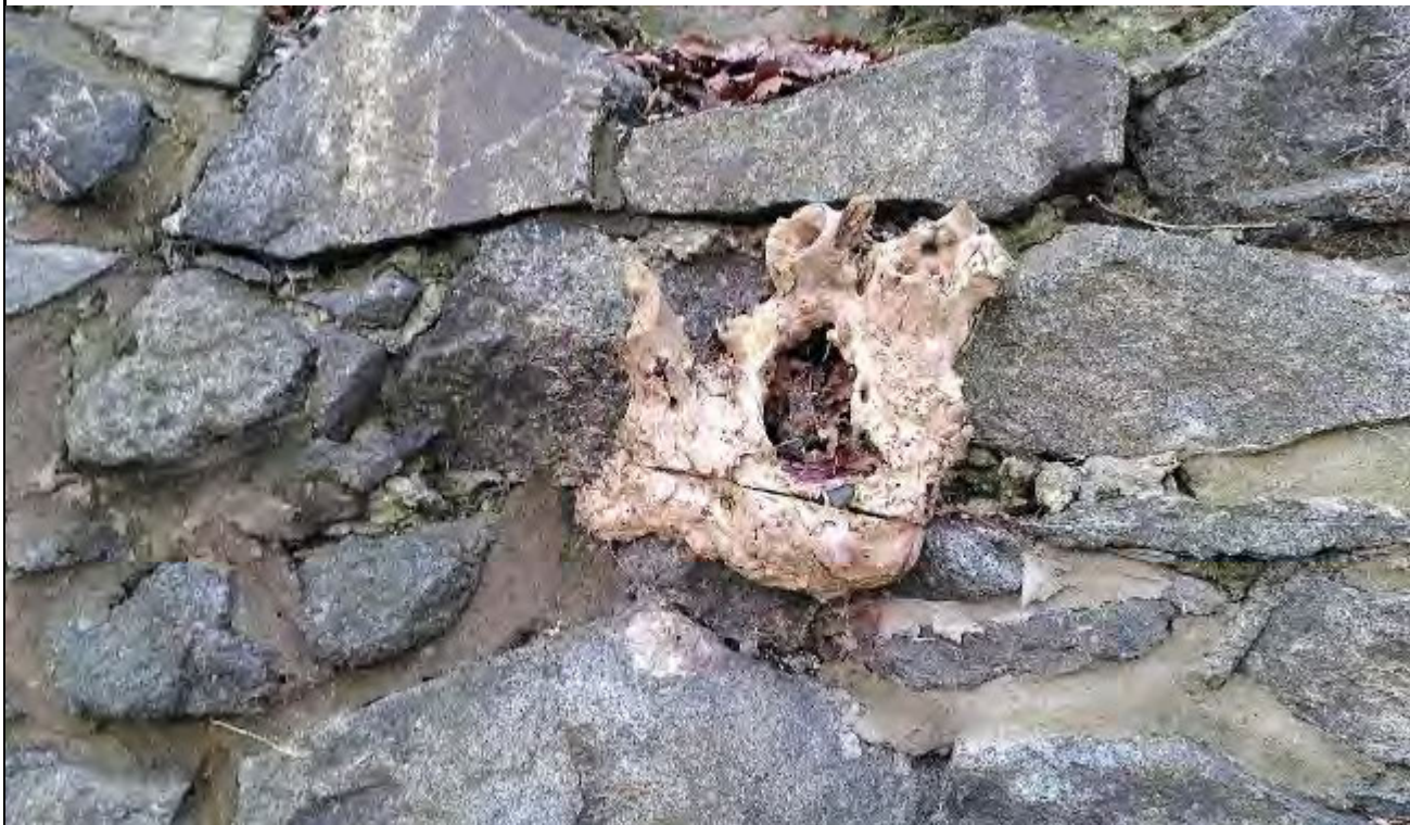
Figure 8: Defect 7