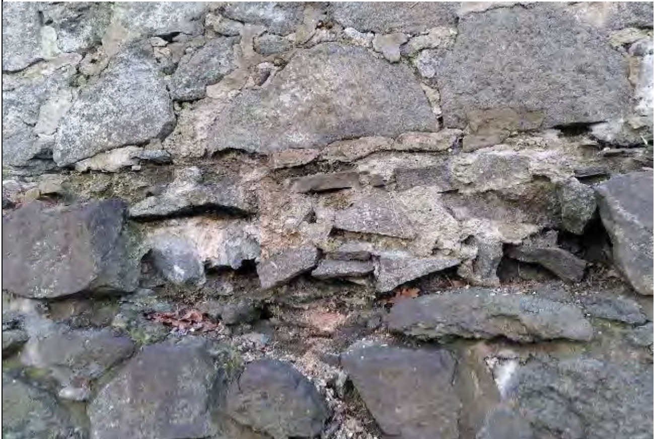
Figure 7: Defect 6