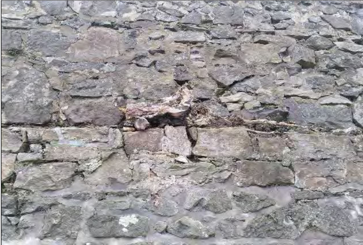
Figure 5: Defect 1