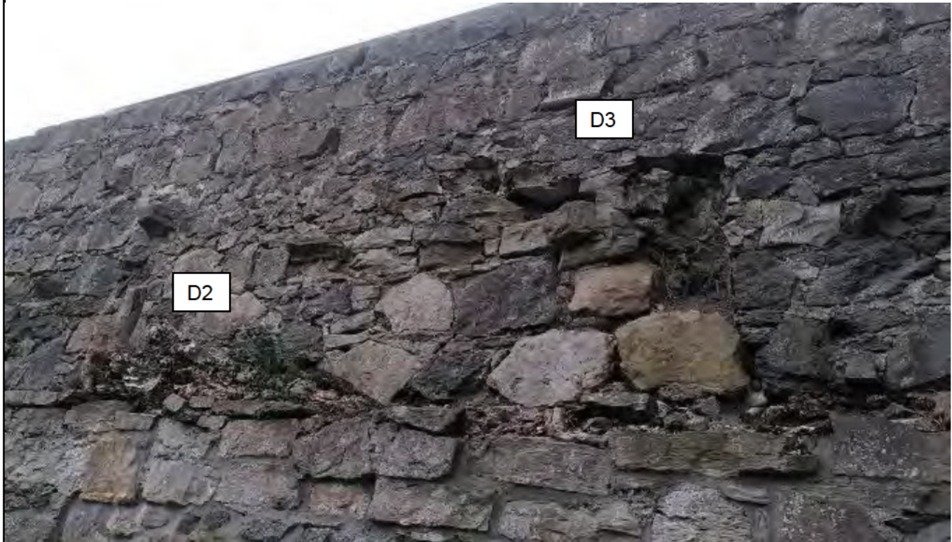
Figure 4: Defects 2 and 3