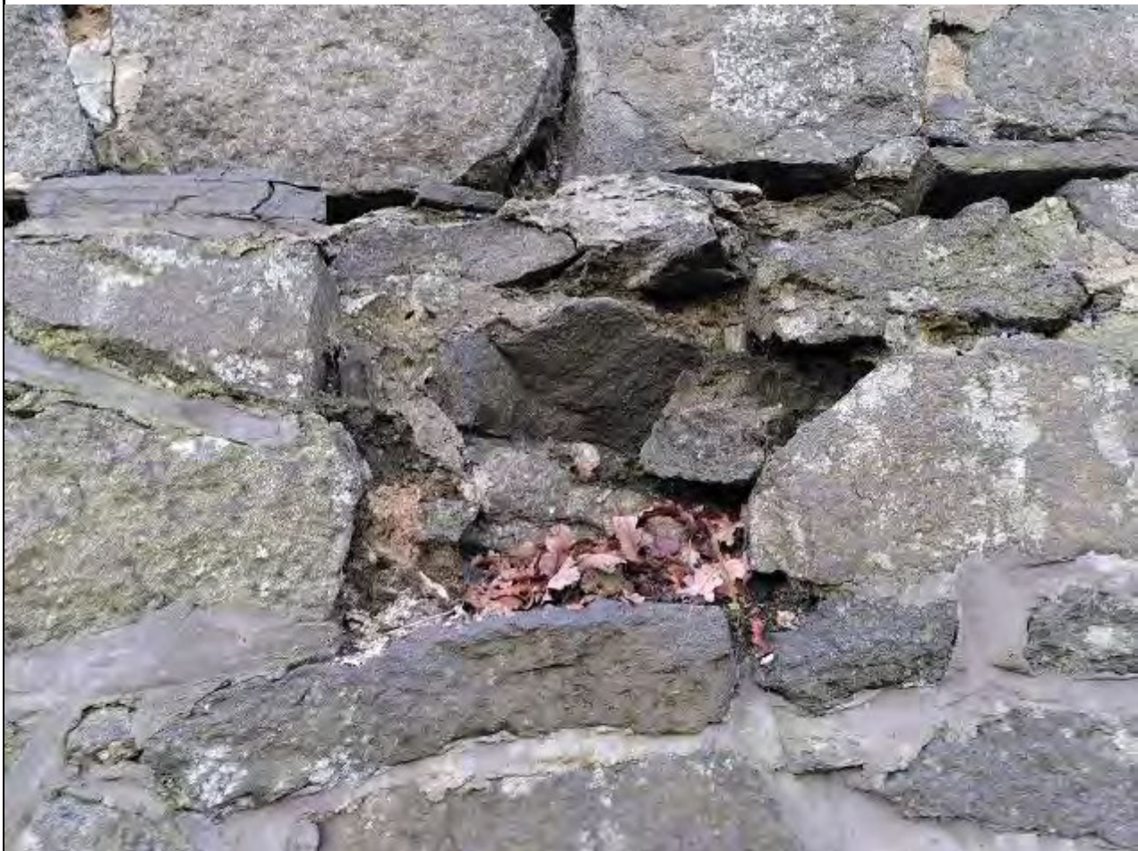
Figure 6: Defect 5